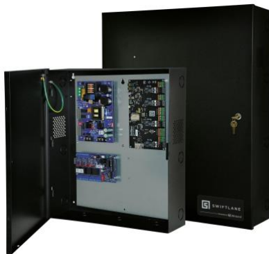
Altronix Trove Access & Power Integration

Pre-configured Trove kits support 4 and 12-Door Configurations