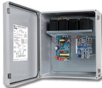
NetWay Spectrum SP4TCW53

Brooklyn, NY (June 18, 2025) – Altronix , the recognized leader in power and data transmission products for the professional security industry, has expanded its power product line with the new POE367 power supply/charger designed specifically for 277VAC input environments . The POE367 offers a robust and efficient solution for powering IP devices, integrating with NetWay Spectrum Hardened PoE Switches at remote or industrial locations where high-voltage 277V power is the only option.